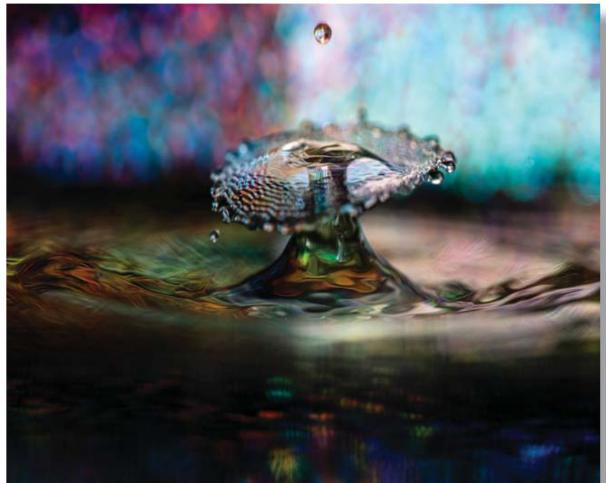
Water Drops Sparkles Brian Spiegel